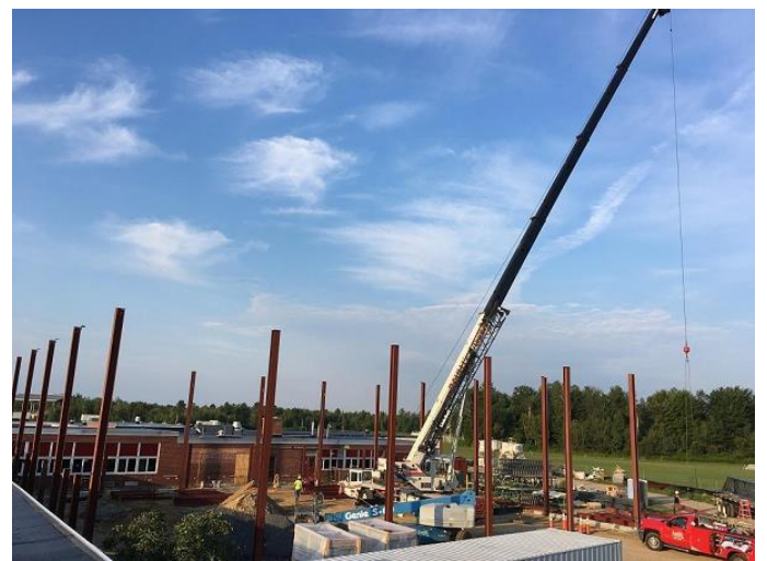
Construction at Gouverneur Middle School