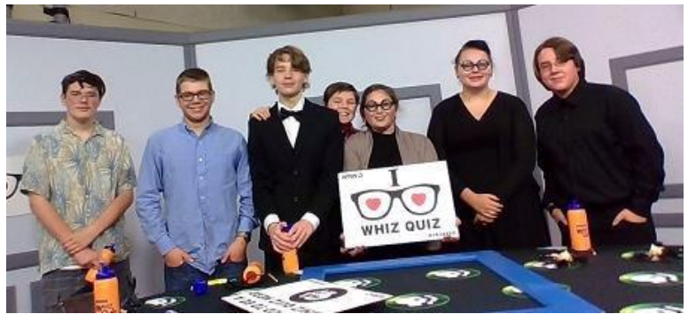
Our Whiz Quiz Team