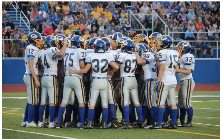
GCS Wildcats Celebrate Victory!